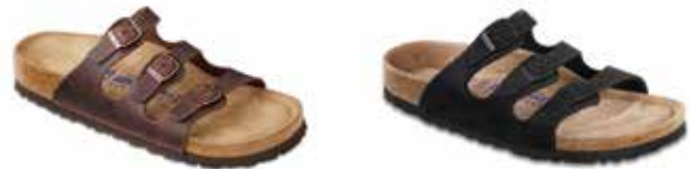
Habana Leather | Black Nubuck