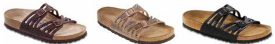
Habana Leather | Tobacco Leather | Black Leather