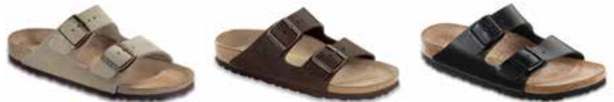
Taupe Suede | Habana Leather | Black Leather