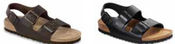
Habana Leather | Black Leather